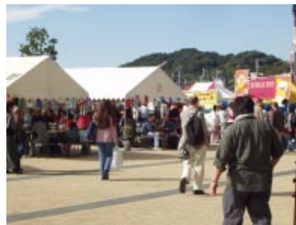
International Food Fair

exposition, and a short inspection of JALT's JIC (job information center), I was off to catch the Open Forum Panel Discussion already in progress. The discussion focussed on the Japanese Ministry of Education, Culture, Sports and Technology project to develop “a strategic plan to cultivate Japanese with English ability,” which aims to help Japanese actually use English. Seating was at maximum capacity for this highly anticipated event and a lively Q & A period followed.