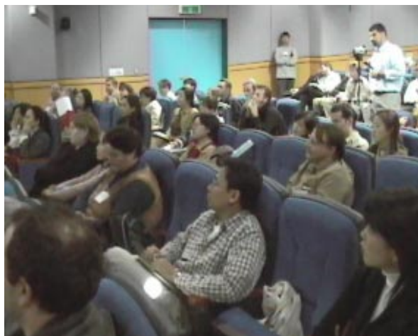
Attentive listeners while web-casting live - invited speakers and workshops alike were live and remain on the internet.

Women's University, Japan (Pearson Education sponsored), outlined the use of Language Planning (LP) to facilitate learner communication, and ways to incorporate LP activities into existing textbooks.