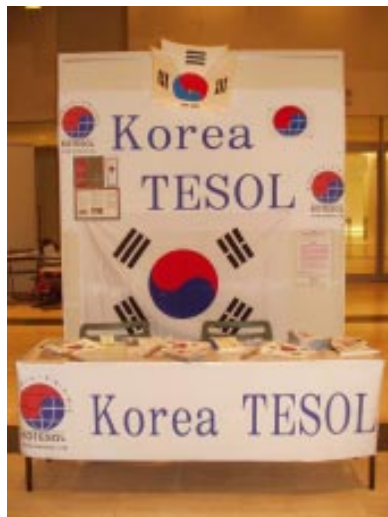
KOTESOL display table at JALT

After a late power breakfast, a quick run through the educational materials