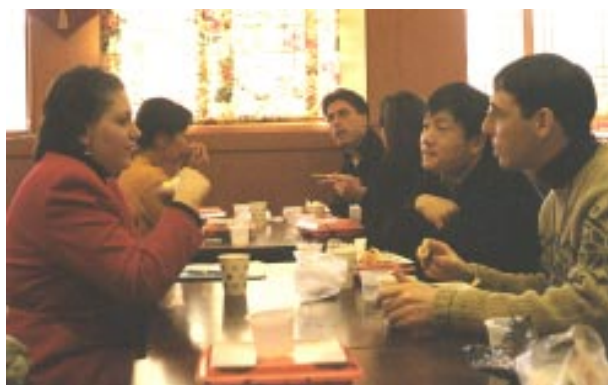
Working discussions through a doshirak lunch

Training, rather than crisis resolution, was an underlying theme for the weekend. The Tourism Education building at Hyecheon College was again the principal venue for the full-day working sessions. Far from a "junket" for KOTESOL "insiders," working through dosirak lunches was a key to making the most of limited time, and discussions continued through a yachaessam dinner on Saturday evening: one group worked past midnight.