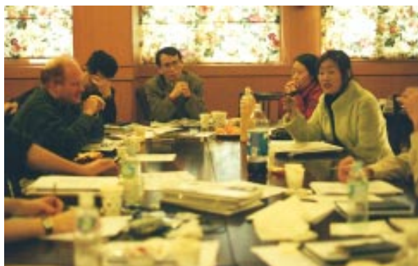
Small working groups aimed for specific recommendations

Decisions great and small, some that impact members, others largely unseen, are always an essential element of such a weekend. Sometimes decisions to leave matters unaltered are as difficult and time-