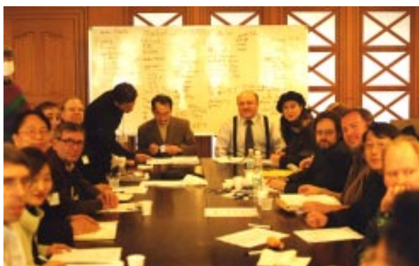
A cluttered whiteboard shows a few discussion points prior to the beginning of the executive council meeting

The executive council meeting finally concluded at 6:50pm Sunday evening and the clearly weary but satisfied discussants trudged out, back to their distant homes to prepare for a new week's teaching or grading and their day-to-day responsibilities in life and in KOTESOL.