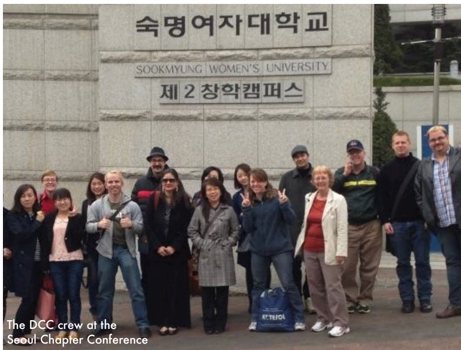
The DCC crew at the Seoul Chapter Conference