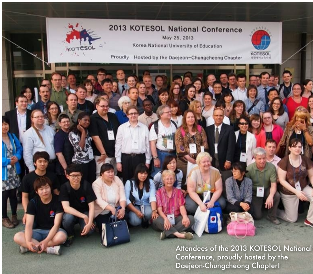
Attendees of the 2013 KOTESOL National Conference, proudly hosted by the Daejeon-Chungcheong Chapter!