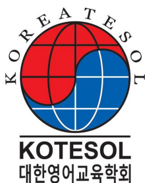
Korea TESOL logo