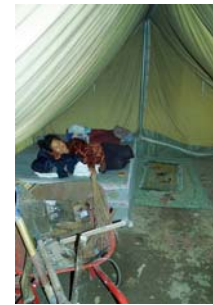
Picture # 3

(#2); his little grocery store was miraculously spared so he still has a way of making money. Like most of his neighbors, though, he had no insurance and so it'll be months before he can afford to build a replacement house. His wife gave me a tour of the inside of their living accommodations (#3). The grand-