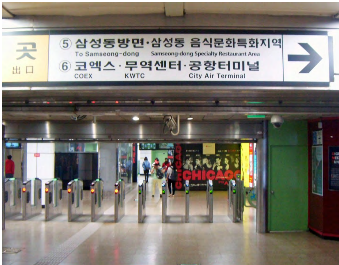
3. Exiting fare gates, looking for exit gates 5 & 6.