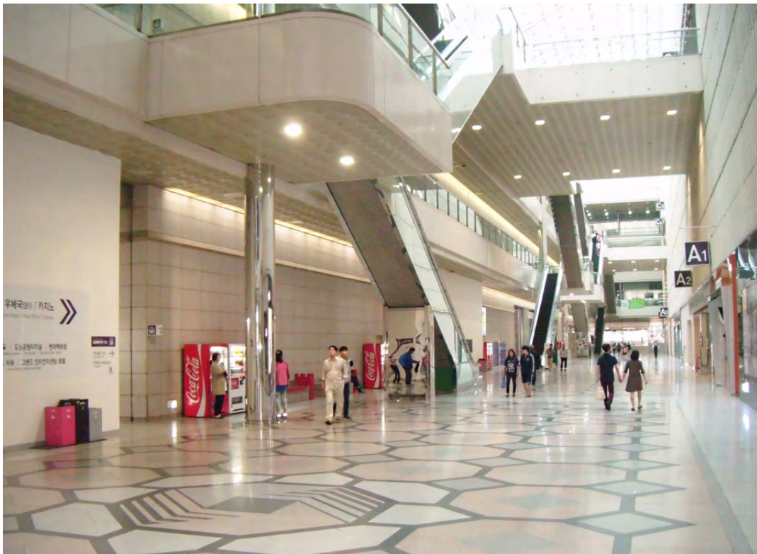
12. The Main Floor of COEX. Take the escalators up to the 3rd Floor for Conference Action! Registration, & Checkin for pre-registrants, is across the bridge, by Hall 'E'.