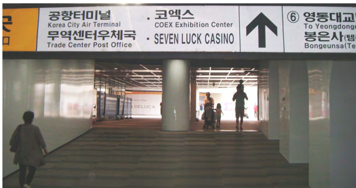
4. You can choose to exit up the stairs for gates 5 or 6, but we recommend you walk out the tunnel between those two exits, straight into COEX Mall.