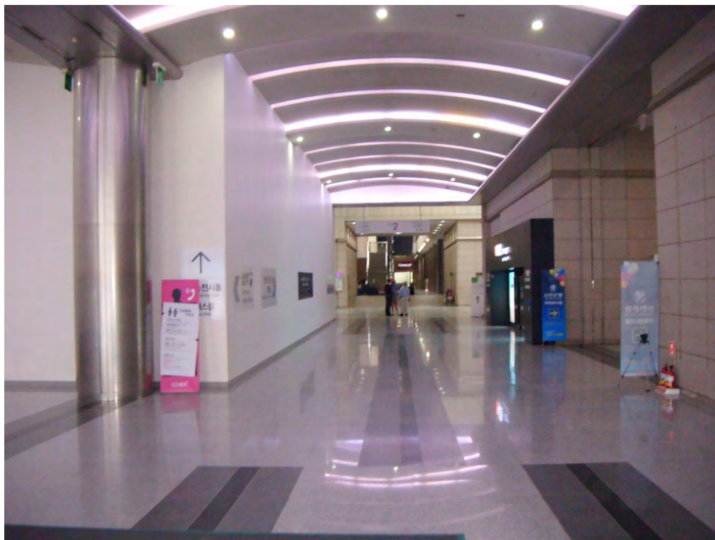
10. South Gate hallway. Go straight on in to the main foyer. there are ATMs and small restrooms in the first hallway to your right.