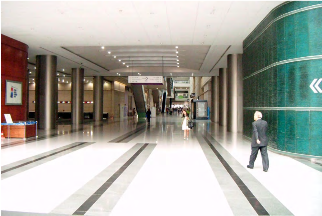
11. Main Foyer (just inside the Main Entrance). Walk straight ahead. Just past the reception desk (where you meet folks coming in from the South Gate) is the opening to the Main Floor of COEX.