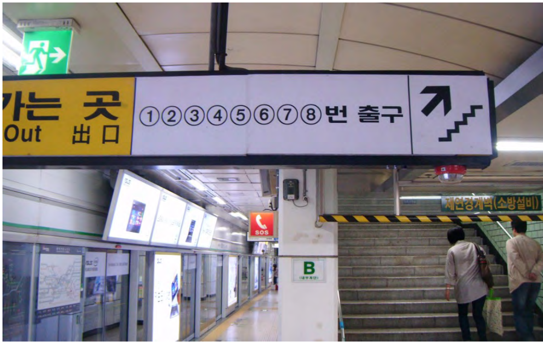
1. As you leave the Metro cars at Samseong Station (line 2) you'll climb the stairs. We are headed to Gates 5 & 6.