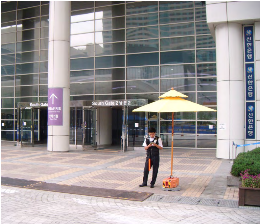
9. South Gate entrance. Pretty Impressive for a side gate!