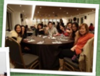
10th Annual Symposium and Thanksgiving Dinner