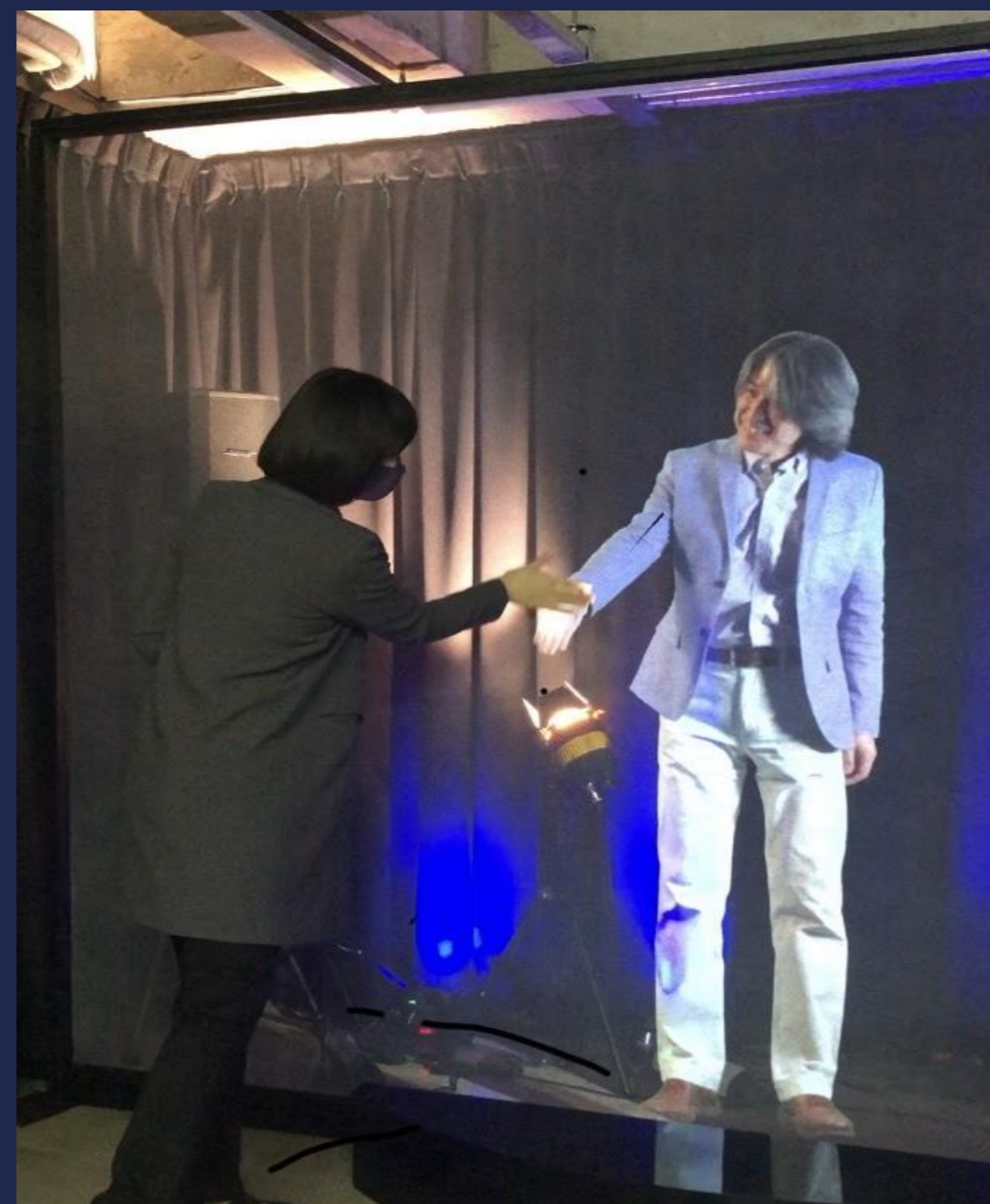
On-site Hologram Speech