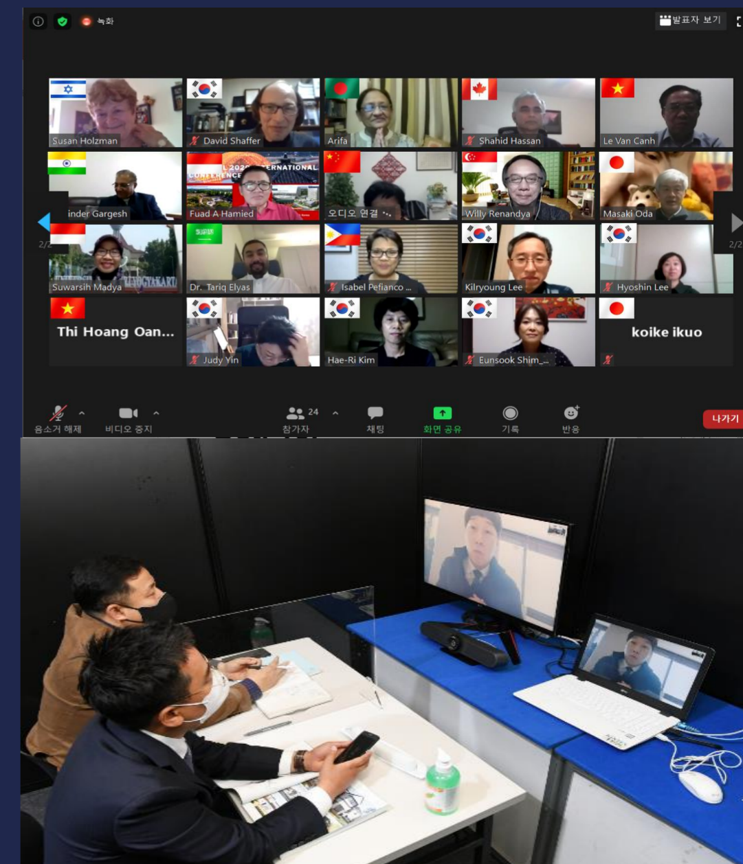
Worldwide Online Presentations